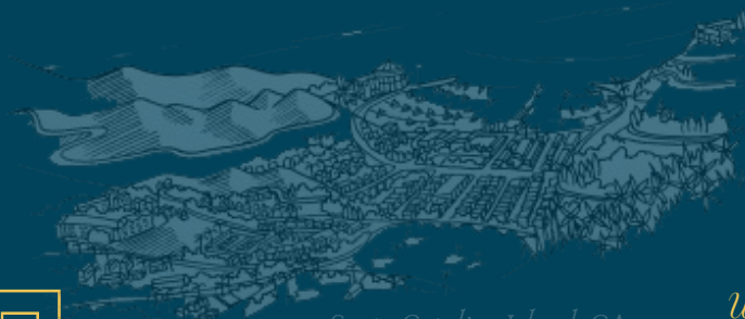
Santa Catalina Island, CA