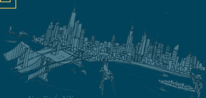
New York, NY